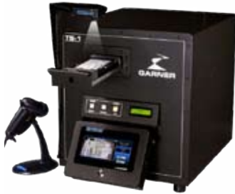
TS-1 IRONCLAD Erasure Verification System