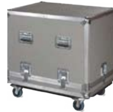
CASE-TS1 MIL SPEC Transport case