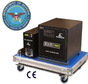
Mobility Package DDM-15SSD

Create the ultimate in top-secret data disposal by adding our NSA/CSS EPL Listed PD-4 hard drive destroyer or our NSA/CSS EPL-listed PD-5 hard drive destroyer and SSD-1 solid-state media destroyer that destroys solid-state, flash USB thumb drives, and SSHD controller boards.