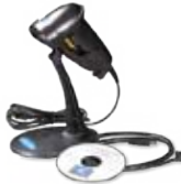
SCAN-1 Media Destruction Report Generator