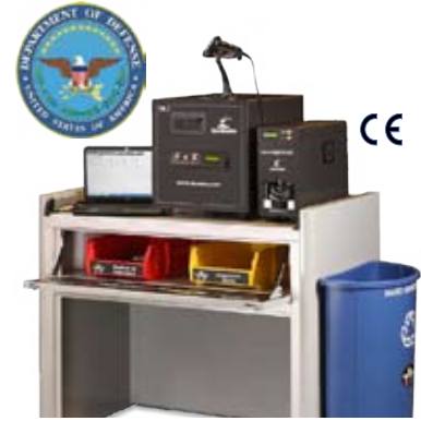
Complete Degauss Destroy Recycle Workstation DDR-15 shown with optional SCAN-1 (laptop not included)