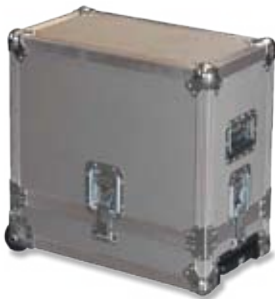
MIL SPEC Transport case