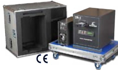
Mobility Package DDM-14

Configure a system to match your needs. Our optional MIL-SPEC transport case with built-in wheels makes it easy to transport the PD-4E to offsite data locations. To ensure data can never be retrieved, pair the PD-4E with our NSA/CSS EPL-listed TS-1E degausser, feature-filled HD-3WXLE degausser, or budget-friendly HD-2XE degausser.