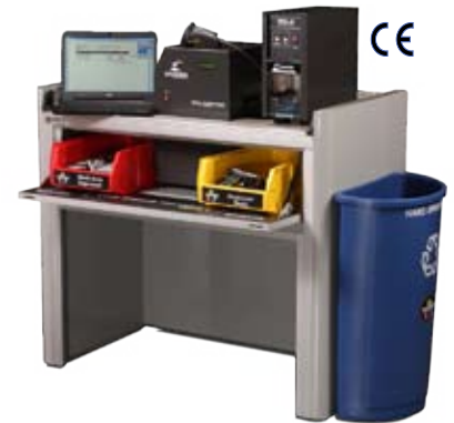
Complete Degauss Destroy Recycle Workstation DDR-34 with optional SCAN-1E (laptop not included)