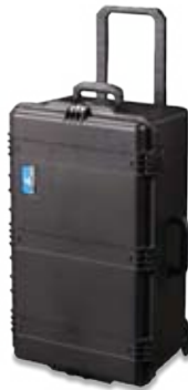
MIL SPEC shipping case