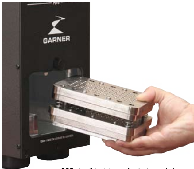
SSD-1 solid-state media destroyer being inserted into the PD-5 destruction chamber