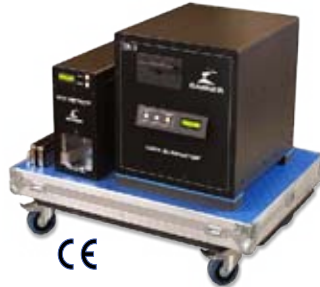
Mobility Package DDM-15 with SSD-1

The PD-5 operates as a standalone unit or as part of a complete degauss-and-destroy system, when paired with our NSA/CSS EPL-listed TS-1 degausser, feature-filled HD-3WXL degausser or budget-friendly HD-2 degausser.