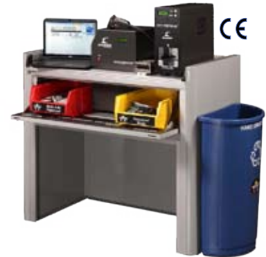
Complete Degauss Destroy Recycle Workstation DDR-35 with optional SCAN-1 and SSD-1 (laptop not included)