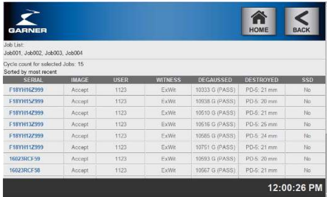
Report view of destruction results