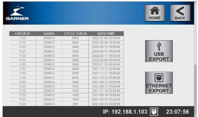
Gauss check report