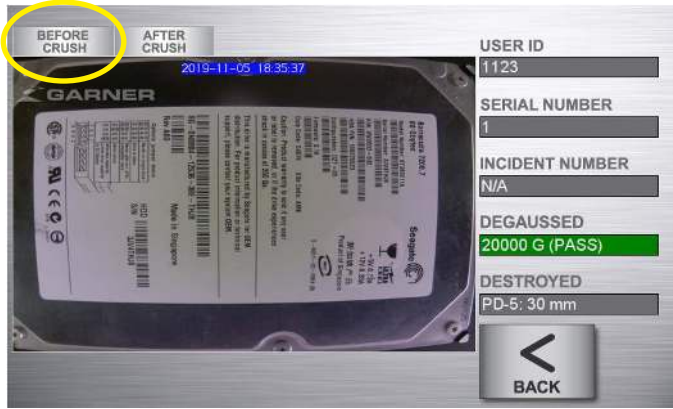
Proof of erasure and destruction