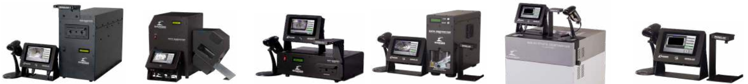
NSA Listed TS-1XT Degausser

Add IRONCLAD to any Garner Degausser and/or destroyer. The IRONCLAD universal model can be integrated into an existing destruction process or function as a stand-alone witness verification.