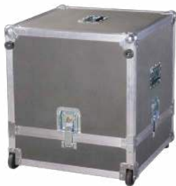
CASE-25SSD Transport Case