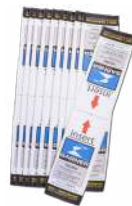
SSD-MT media transport sleeves