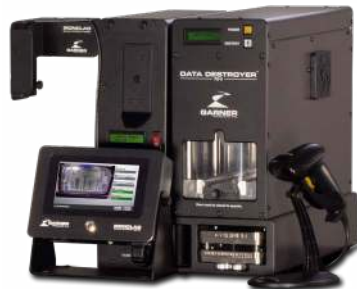
IRONCLAD Erasure Verification System